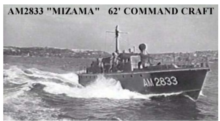
AM2833 was used as a VIP craft in Japan, with blue hull and white superstructure. It was returned to Australia in the early 50's and was used as a VIP craft in Sydney until sold in the late 60's. She entered the tourist trade on the Great Barrier Reef but burned and became a total loss in the early 80's