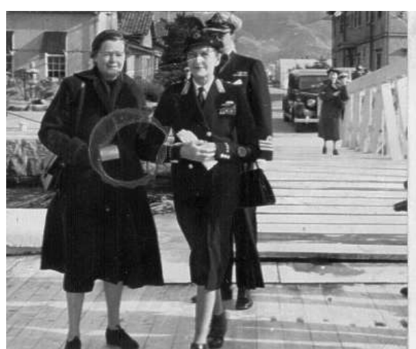
Lady Mountbatten boarding "Kuranda" at HMAS "Commonwealth"

worked. If a craft was required to remain at a location for sometime then it would invariably be an ALC20 that was despatched. All craft were kept in meticulous condition.