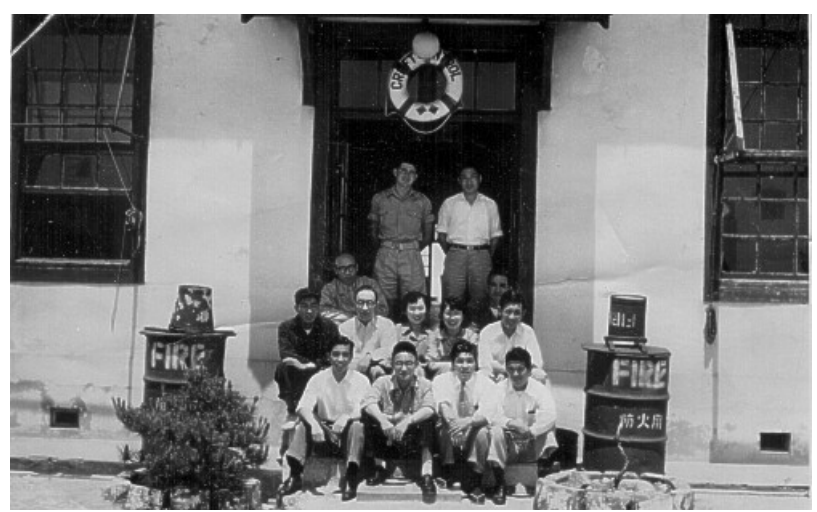
The Admin staff of Britcom Tn. Squadron

Naval Auxiliary ship during WW2 and had been torpedoed twice. He must have felt a sense of disgust at having a 20 year old Spr. as his superior but he never displayed any emotion at all and in fact was the epitome of politeness and loyalty.