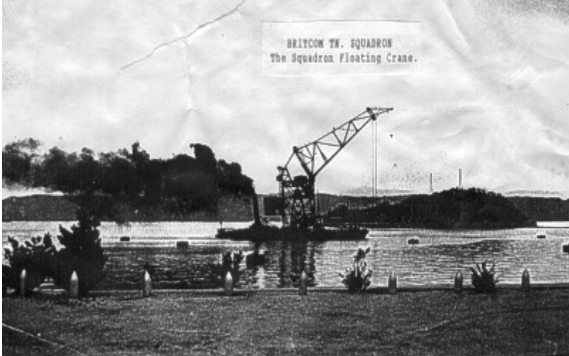
The 75 ton floating crane of Britcom Tn. Squadron

The "KURANDA" had engine telegraphs fitted and I soon learnt to handle and control her like the 62' Command Craft. The main craft that was a delight to handle was the 62' Command Craft that had been returned to us by the RAAF. Since Point Camp was open to the elements we had secondary protected moorings for the craft which would be used when a Typhoon alert was ordered. This was at "Cassels Camp" and was literally an enclosed basin in which the craft were moored to pontoons, the same as at Point Camp. We had a weather station on a small island adjacent to Point Camp and they hoisted warnings when applicable. We would then move craft and crews to Cassels Camp for the night or until the warning was rescinded. We moved a few times but no Typhoon ever developed.